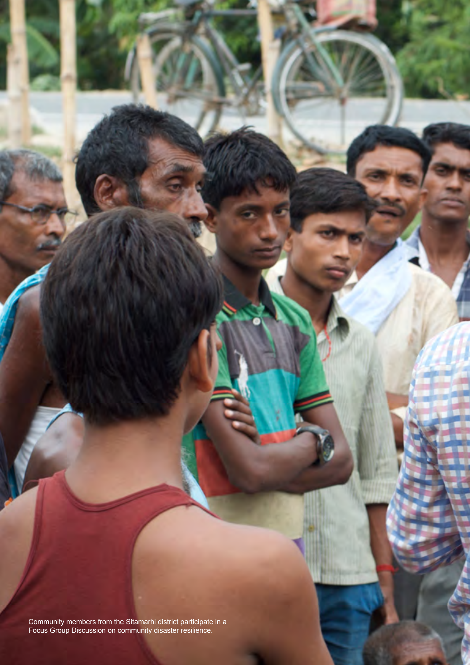
Community members from the Sitamarhi district participate in a Focus Group Discussion on community disaster resilience.