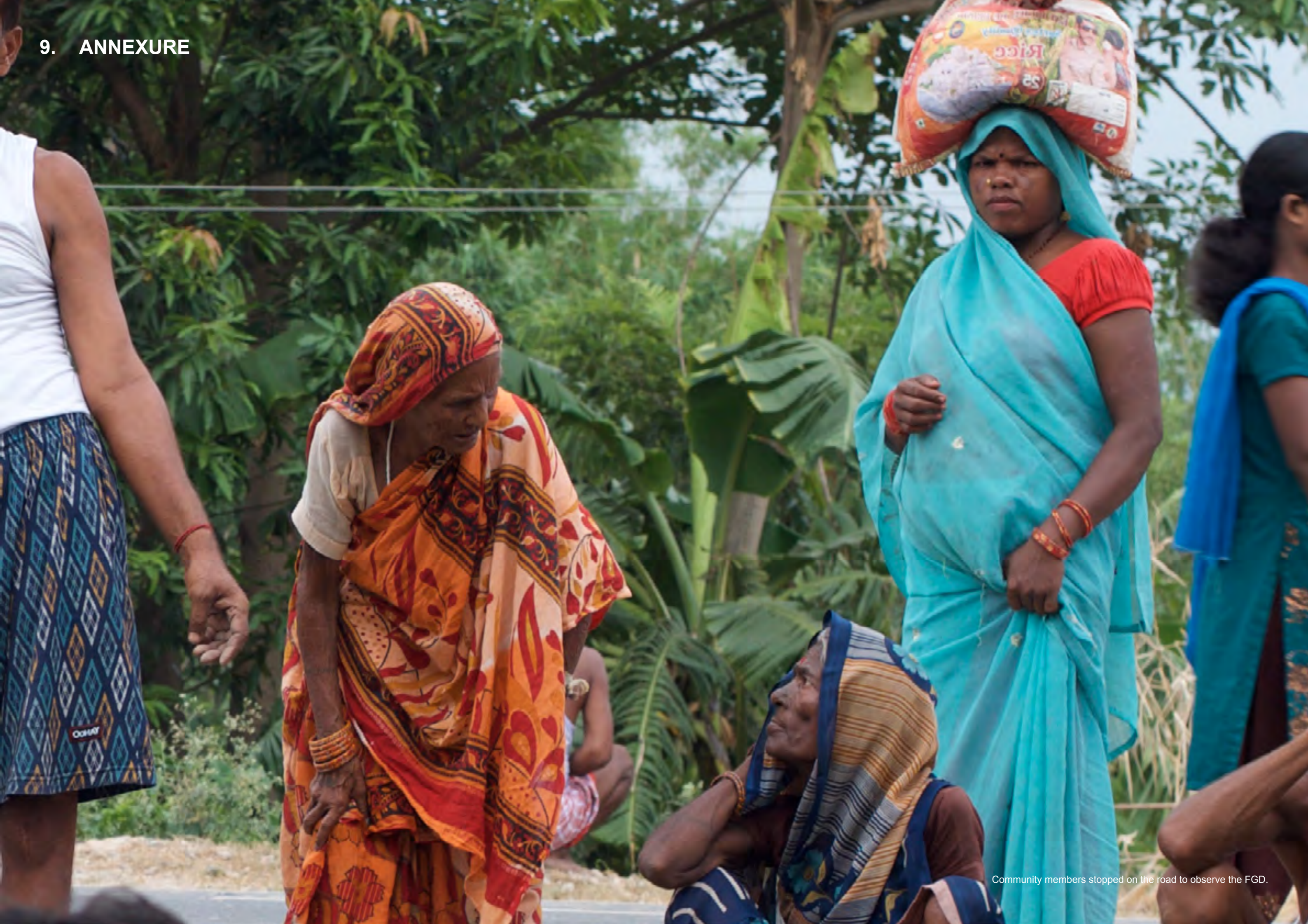
Community members stopped on the road to observe the FGD.