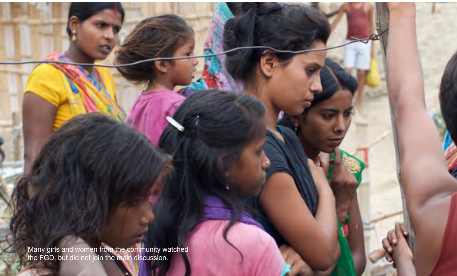
Many girls and women from the community watched the FGD, but did not join the main discussion.

Apart from that, certain limitations may come into existence without notice. The timeframe for the assignment is feasible to complete the tasks accordingly. However, it is expected appropriate availability and cooperation from the district officials and line department's representatives. While AIDMI is the main responsible to facilitate and conduct the preparation of the DDMPs, districts' engagement is fundamental to a) bring legitimacy to the process and b) empower the agencies to head future plans and activities related to disaster risk reduction. Additionally, the deliverables and respective findings are to be a platform for further action and review by the DDMA's.