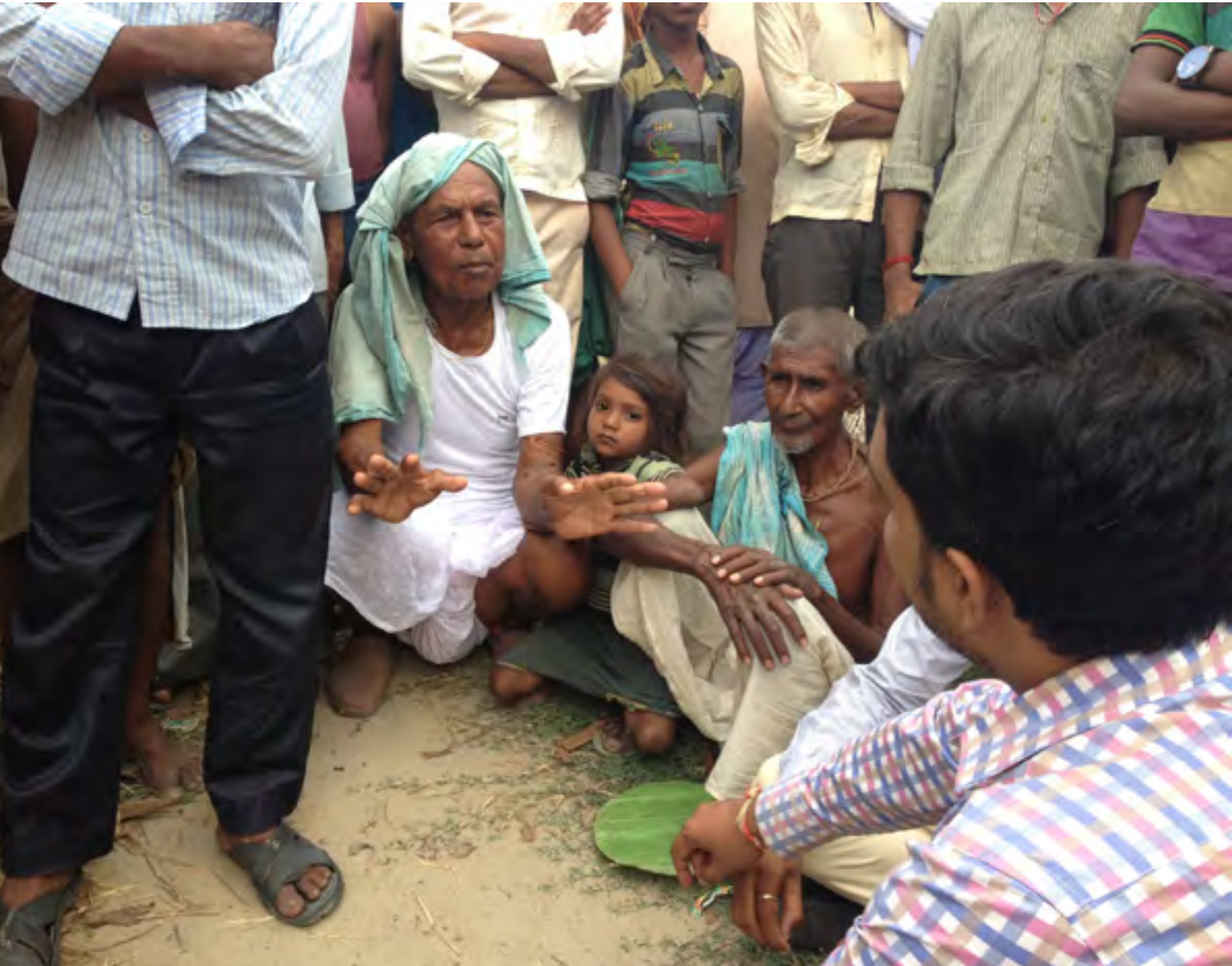
The FGD in Sitamarhi was led by a charismatic elder from the community.